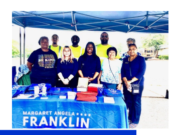
Dumpster Day, Fred Lynn Middle School May 2023